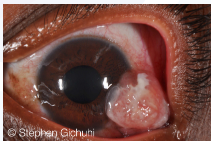
© Stephen Gichuhi Squamous cell carcinoma of conjunctiva

Herpes zoster ophthalmicus (HZO) [her·pes zoster oph·thalmi·cus]: HZO is a common infection caused by reactivation of the chickenpox virus. It can occur in older adults (60+) or in younger people who are living with HIV. HZO can occur anywhere in the body, most commonly on the face and eyes. HZO causes a blistering and crusty rash to defined areas of the body. It can damage the eyes, causing pain and loss of vision.