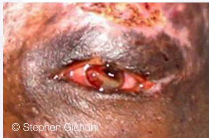
Herpes zoster ophthalmicus

Kaposi's sarcoma [kuh·poh·seez sarcoma]: Kaposi's sarcoma is a rare tumor that occurs in the eyes of patients with HIV. It is a red or purple mass that forms on the white part of the eye or on the eyelid. Kaposi's sarcoma can also appear on other places of the body, most commonly on the skin or mouth.