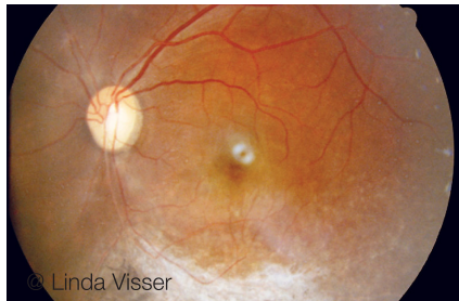
Cytomegalovirus (CMV) retinitis

Cytomegalovirus (CMV) retinitis [sai·tow·meh·guh·low·vai·ruhs reh·tuh·nai·tuhs]: CMV retinitis is the most commonly occurring opportunistic infection inside the eye of individuals living with HIV, and occurs in 20-30% of individuals with AIDS (acquired immunodeficiency syndrome). Opportunistic infections are infections that occur more often and are more severe in people with weakened immune systems. CMV infects the retina when HIV has weakened the immune system of an infected person. It often occurs in individuals with advanced stages of AIDS. Without proper treatment, CMV retinitis can destroy the retina, optic nerve , and cause retinal detachment (the retina pulls away from the back of the eye). This results in blindness.